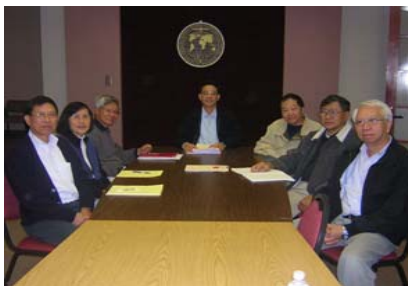
Partial Committee in L.A. Bread of Life Church in Torrance, California, USA