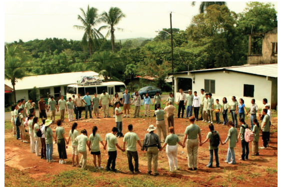
Future Site Of Chepo Missionary Training Center

In Canglon , at the end of the Pan American highway, there is no pavement, only mud. The governor of the Darien state joined us. There, in the midst of this dark